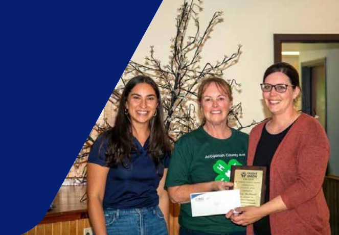
East Coast CU staff preparing an award for the 4H Pro Show supported by our credit union.