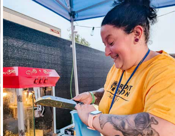
Serving up popcorn at Nova Scotia Summer Fest in Antigonish.