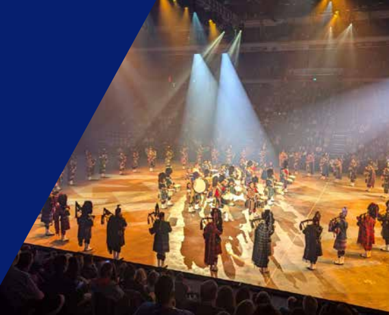
East Coast CU was proud to be a presenting sponsor of the Royal Nova Scotia International Tattoo.