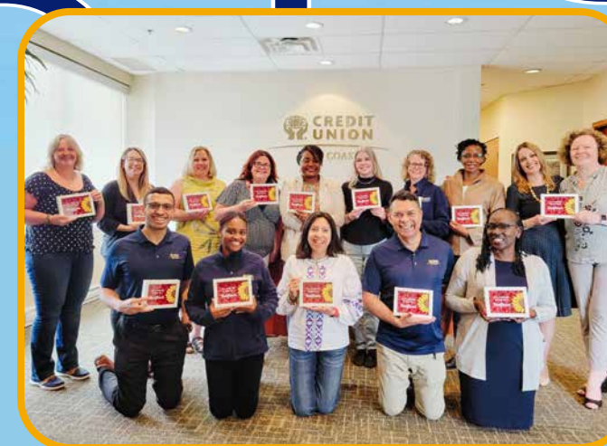
The East Coast CU DEI Committee on our DEI Day.

We strive to invest time and resources in advancing our DEI journey and fostering opportunities for learning, change and upholding accountability.