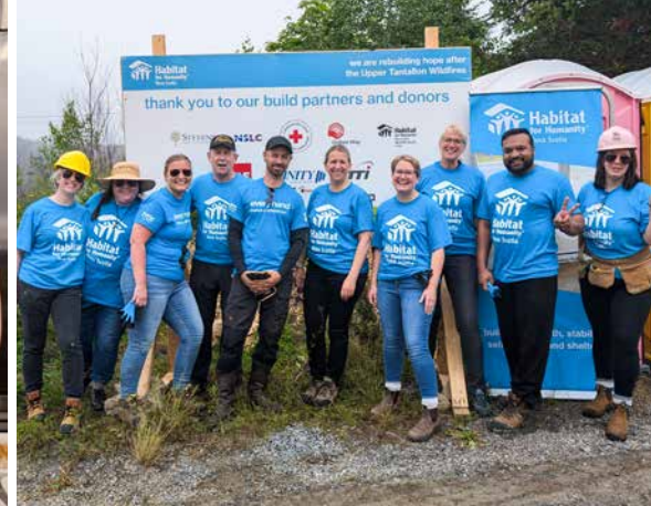
Staff participating in Habitat For Humanity Build Day.