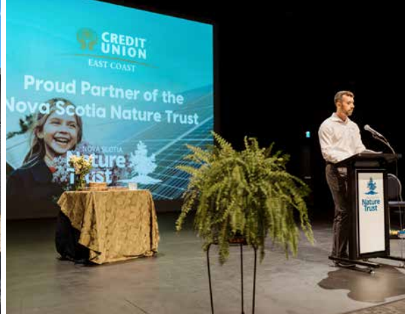
Supporting the Nova Scotia Nature Trust Showcase.