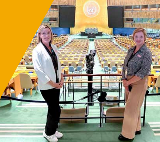
Visit to the United Nations Federal Credit Union's United in Sustainability Summit.