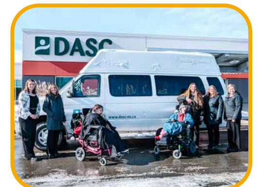
Staff visit Dartmouth Adult Services Centre, one of the 2024 Community Compass Grant winners.

$10,000 LOCHABER GROWERS COOPERATIVE Roots of Resilience Program