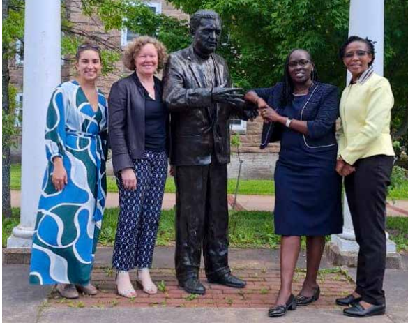
Delegates from Keyna for the Women's Mentorship Program.