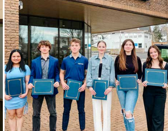
Some of the East Coast CU 2024 Student Bursary winners.