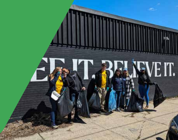
Dartmouth location community clean-up for Earth Day 2024.